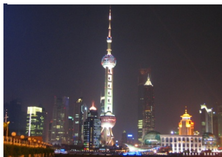
Skyline with Oriental Pearl Tower, Shanghai.